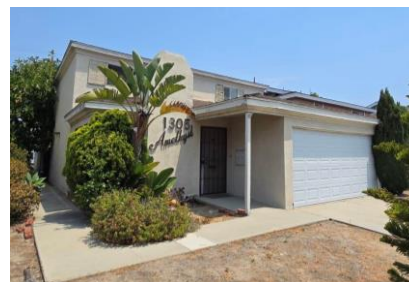
Property purchased (ex.)

Contact: Public Relations Department, Daito Trust Construction Co., Ltd. 2-16-1 Konan, Minato-ku, Tokyo 108-8211, Japan Tel. +81-3-6718-9174 / Email koho@kentaku.co.jp / Website https://www.kentaku.co.jp/